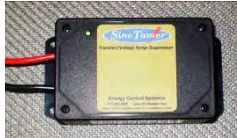
Unit above is a representation only of the ST-SP120-P. Actual unit has 3 wires.